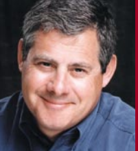
RSAMD President Sir Cameron Mackintosh