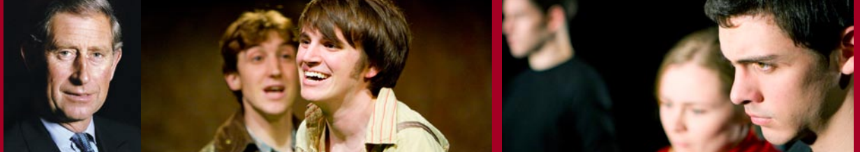
RSMAD Patron HRH, The Prince Charles, Duke of Rothesay